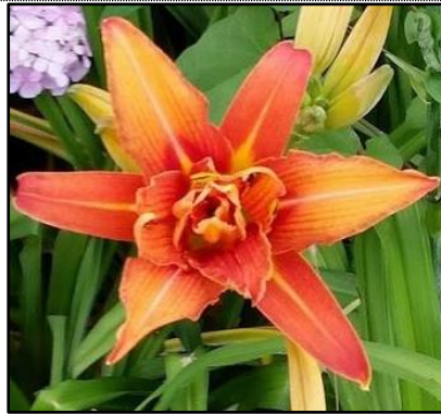
DOUBLE DAY LILY Orange easy-care perennial for full/partial sun in the landscape or a container; summer blossoms. 6 in gallon pots