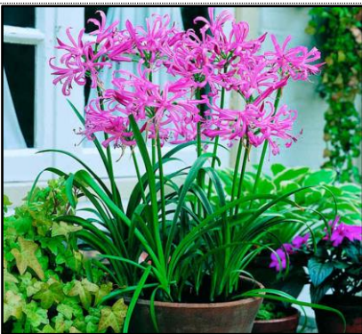
NERINE LILY 8"-12" airy perennial for garden or container; partial sun in well-drained soil; pink blossoms held high late summer through fall. 8 in gallon pots (5-10 bulbs/pot)