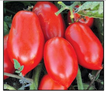
NOVA SAUCE TOMATO Early-to-ripen 1.5"-2" elongated meaty fruit; perfect for deeply flavored sauces or drying; full sun. 10 in 4" pots