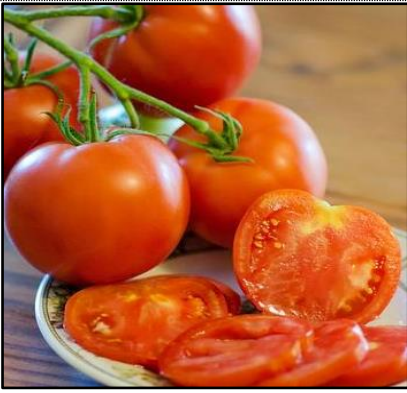
FANTASTIC SLICING TOMATO 3"-5" firm round fruit with rich beefsteak flavor; stake in full sun. 18 in 4" pots