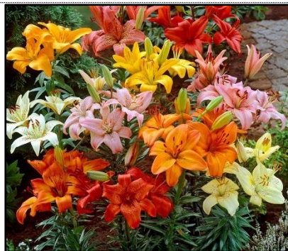
ASIATIC LILY Up to 4' tall easy-care perennial for full/partial sun in the landscape or a container; surprise color! 4 in 4" pots