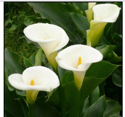
CALLA LILY 2'-3' tall perennial best in full sun in garden or container; dramatic leaves; elegant long-lasting white blossoms in spring; spreads if you let it. 4 in gallon pots