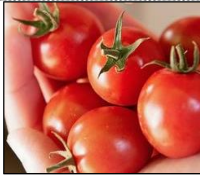
RED CHERRY TOMATO Flavor and sweetness in every bite- sized globe; full sun in garden or container; mixed varieties. 20 in 4" pots