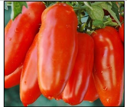
POMODORO SQUISITO TOMATO An abundant harvest of thick, meaty, flavorful fruit in late summer for sauces or drying; full sun. 12 in 4" pots