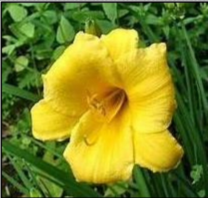
STELLA D'ORO DAY LILY Yellow easy-care perennial for full/partial sun in the landscape or a container; summer blossoms. 6 in gallon pots